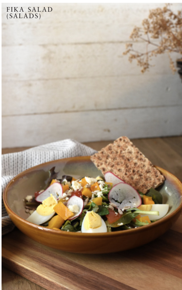
FIKA SALAD (SALADS)