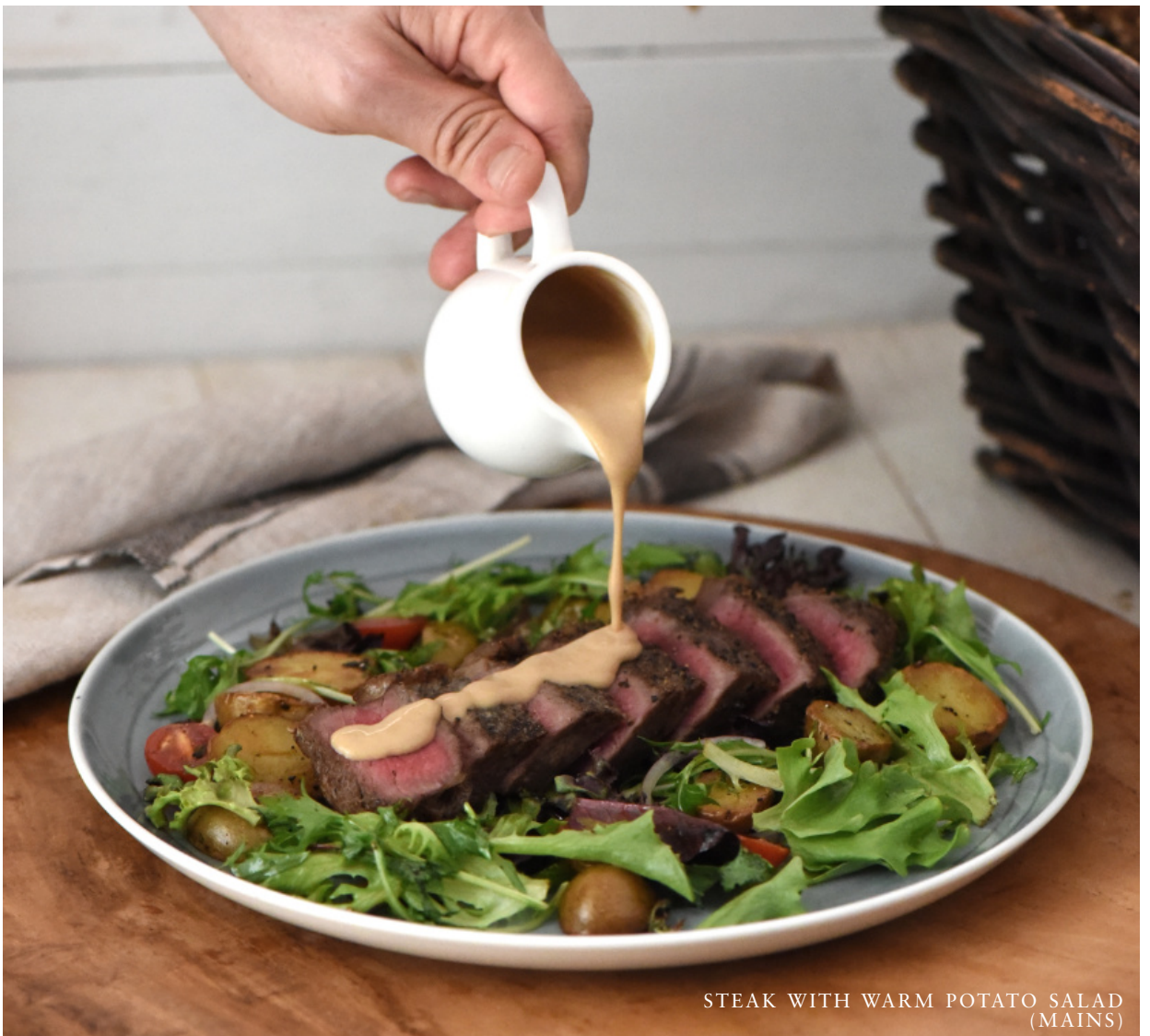
STEAK WITH WARM POTATO SALAD (MAINS)