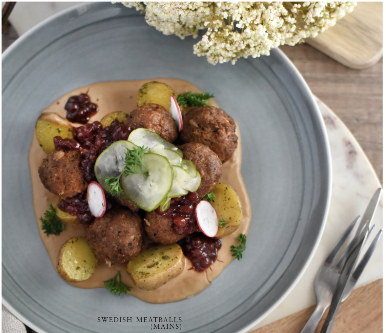
SWEDISH MEATBALLS (MAINS)