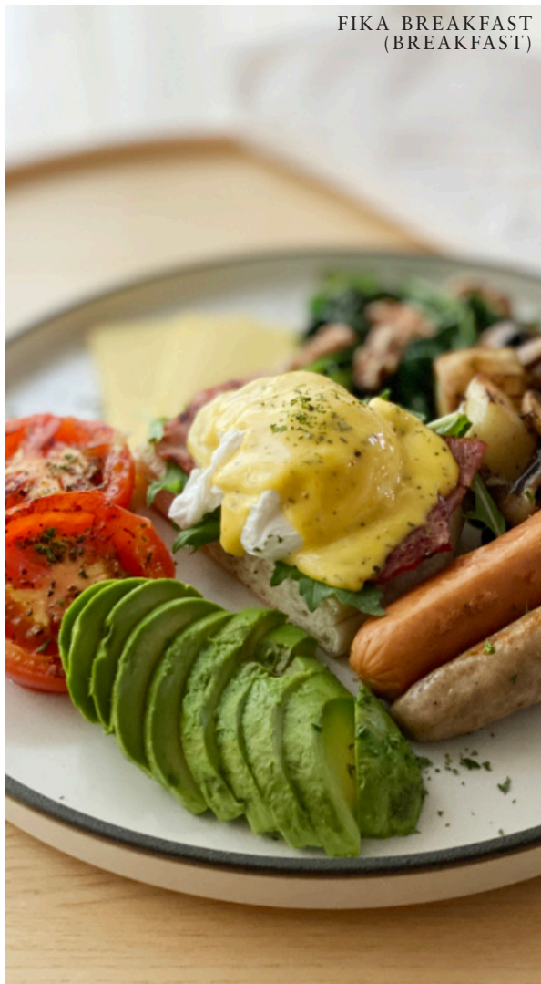
FIKA BREAKFAST (BREAKFAST)