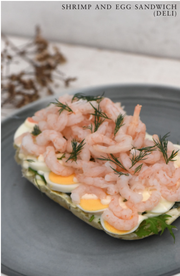
SHRIMP AND EGG SANDWICH (DELI)