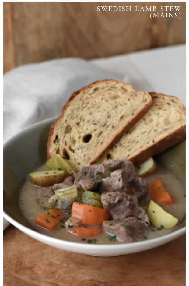
SWEDISH LAMB STEW (MAINS)