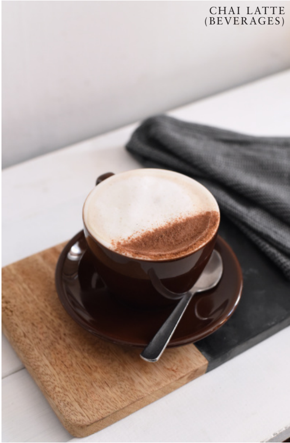
CHAI LATTE (BEVERAGES)