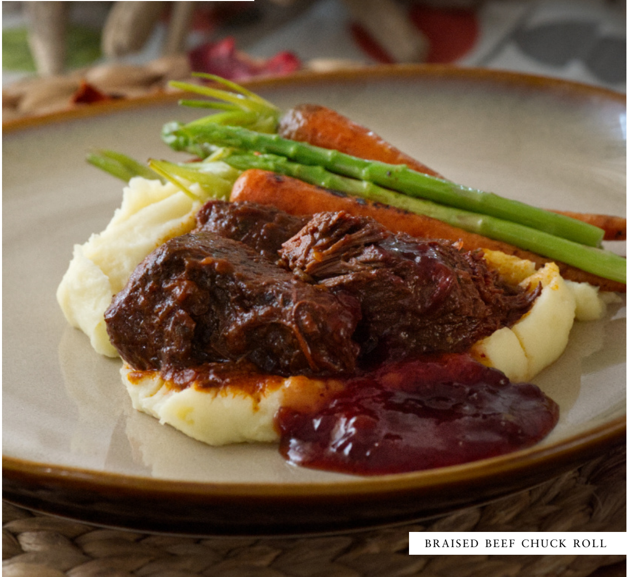
BRAISED BEEF CHUCK ROLL