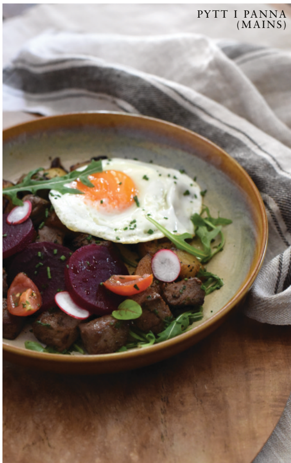
PYTT I PANNA (MAINS)