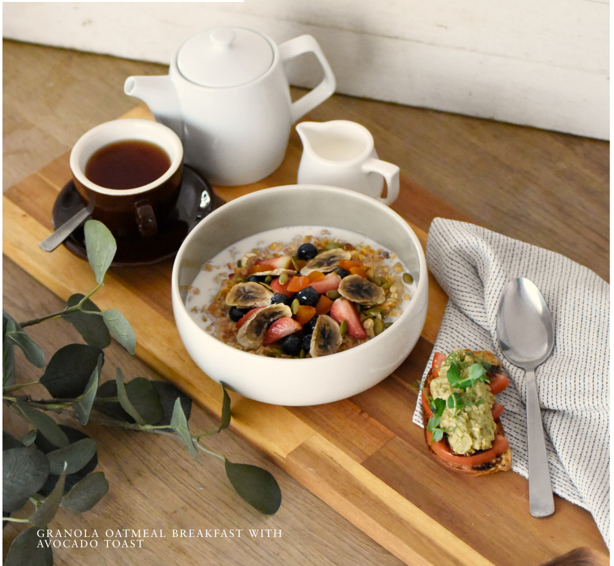
GRANOLA OATMEAL BREAKFAST WITH AVOCADO TOAST