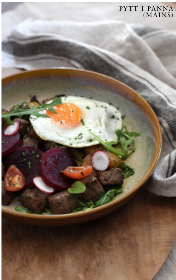
PYTT I PANNA (MAINS)