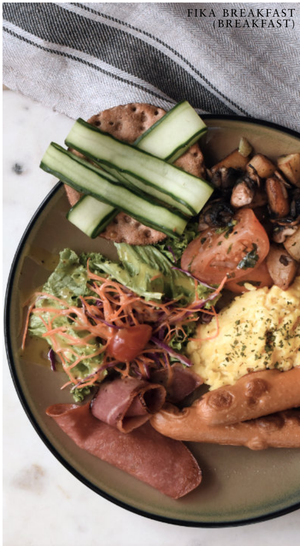
FIKA BREAKFAST (BREAKFAST)